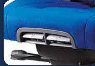
K4 Cushion length and tilt adjustment