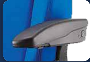
Tip-up Armrest 30° tilt adjustment to maximise elbow and arm support. Retractable for desktop access