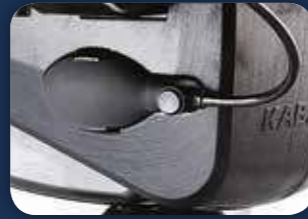
Air Lumbar To give good lower dorsal support