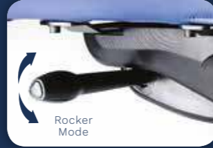
Rocker Tension To ensure optimum seating position