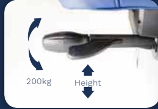
Height Adjustment and Tilt Rocker Adjustment Weight adjustment 50-200kg