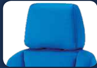
Headrest Height/Tilt adjustable