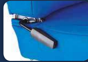
Backrest Angle Support 16° range to maximise user comfort