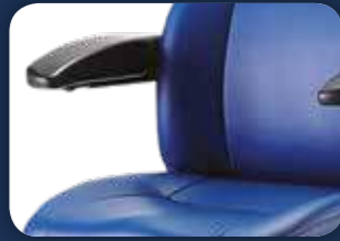
Cushions Body contoured cushions for comfort and support