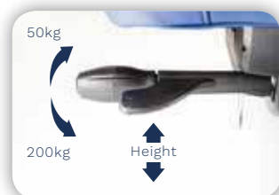
Height Adjustment and Tilt Rocker Adjustment Weight adjustment 50-200kg