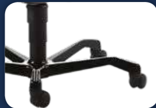
New KAB 5 Star Base Durable stylish black aluminium base