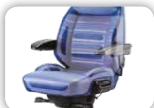
KAB Air Comfort System (ACS) To mould the chair simply press the + symbol to inflate and - symbol to deflate. Main charge is supplied to boost the 12v rechargeable battery every 3-4 months (subject to usage)